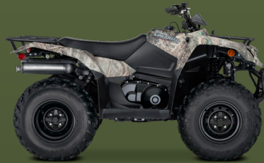
True Timber Kanati

Ready to take riders on their next outdoor adventure, the 2025 Suzuki KingQuad 400ASI Camo is wearing True Timber® Kanati pattern camouflaged bodywork and riding on strong, steel wheels shod with aggressive 25-inch Carlisle® tires. The fully automatic Quadmatic™ transmission has 2WD and 4WD modes to manage rough trail conditions while completing even the most demanding chores. Along with exceptional engine performance across the powerband, its high-performance iridium spark plug, and Pulsed-secondary AIR-injection (PAIR) system help provide outstanding fuel efficiency and impressive performance.